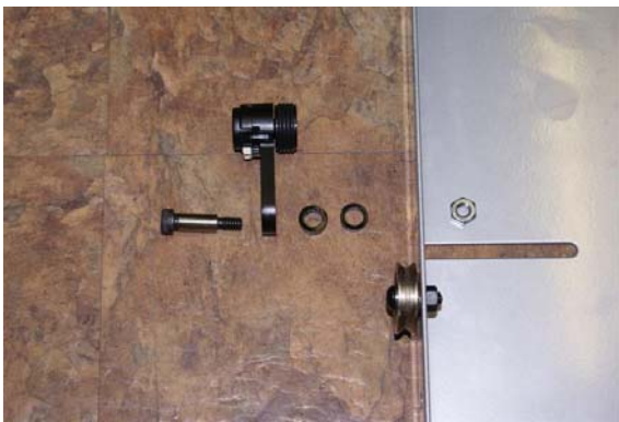
Bolt, encoder, 2 spacers, and nut.